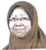
Pakar Perubatan Kesihatan Awam, Fakulti Perubatan dan Sains Kesihatan, Universiti Putra Malaysia (UPM)