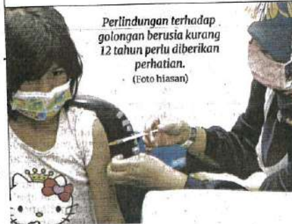
Perlindungan terhadap golongan berusia kurang 12 tahun perlu diberikan perhatian. (Foto hiasan)

Semua pihak perlu bersungguh dan bersama memastikan rakyat selamat apabila melangkah bersama ke fasa endemik sepenuhnya nanti.