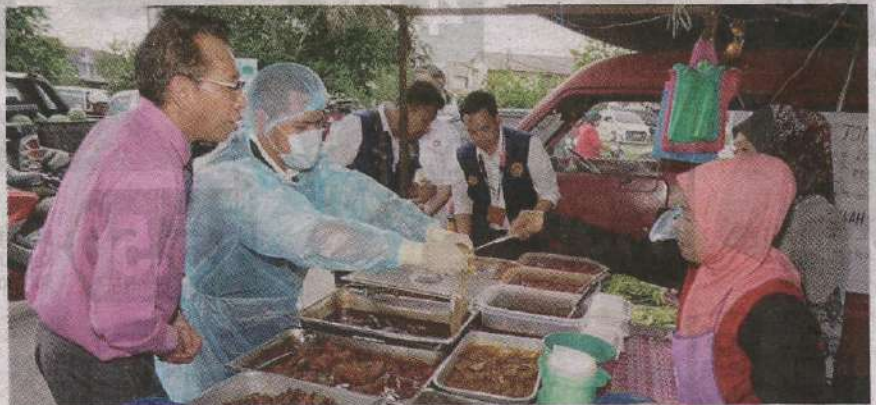
Faktor kebersihan diri peniaga bazar Ramadan dan cara mengendalikan makanan juga perlu dititik berat bagi mengelak berlakunya keracunan makanan kepada pelanggan mereka.

Pada 3 April lalu, Kementerian Kesihatan Malaysia (KKM) merekodkan peningkatan kes keracunan makanan sepanjang Ramadan pada 2021 ber-