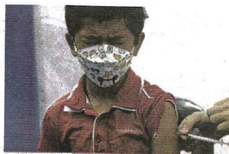
A child receiving his first dose of the Covid-19 vaccine in Seberang Jaya, Penang, recently.

required breathing assistance had dropped to 122 on Wednesday from 131 patients the day before, adding that ventilator usage was now at 14 per cent, he said.