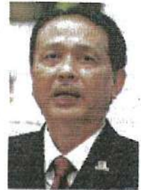
DR NOOR HISHAM

Bagaimanapun, beliau berkata, tiada kluster baharu direkodkan pada Rabu menjadikan jumlah keseluruhan kluster aktif sebanyak 151.